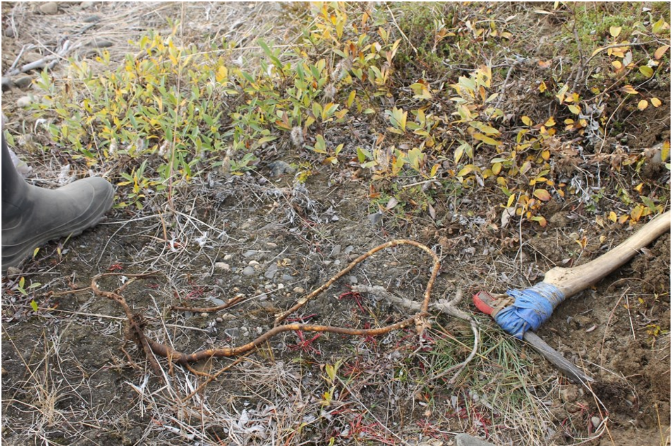
Figure 3 Digging for H. hedysaroides in Lorino. This species, reported as an important “mouse root,” is now more commonly gathered by hand.