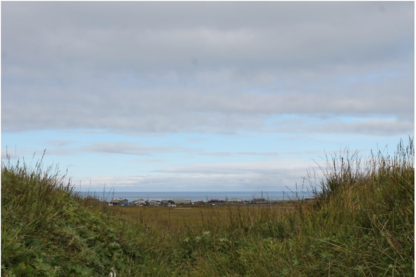
Figure 2 High-ground tundra where people search for “mouse roots,” with the village of Neshkan in the background.

( Odobenus rosmarus ), spotted seal ( Phoca largha ), and bearded seal ( Erignathus barbatus ). Fishing, hunting game, and gathering of wild plants also play an important role for both peoples (Jernigan et al. 2017). Ethnographers (Kerttula 2000; Kozlov et al. 2007) have typically drawn a cultural distinction between the coastal Chukchi and those who live in the interior as nomadic reindeer ( Rangifer tarandus ) herders. However, the coastal villages where we worked also show some influence from the interior traditions due to mixed marriages, as well as because some still have reindeer herding brigades left over from Soviet times (Krupnik and Chlenov 2013).