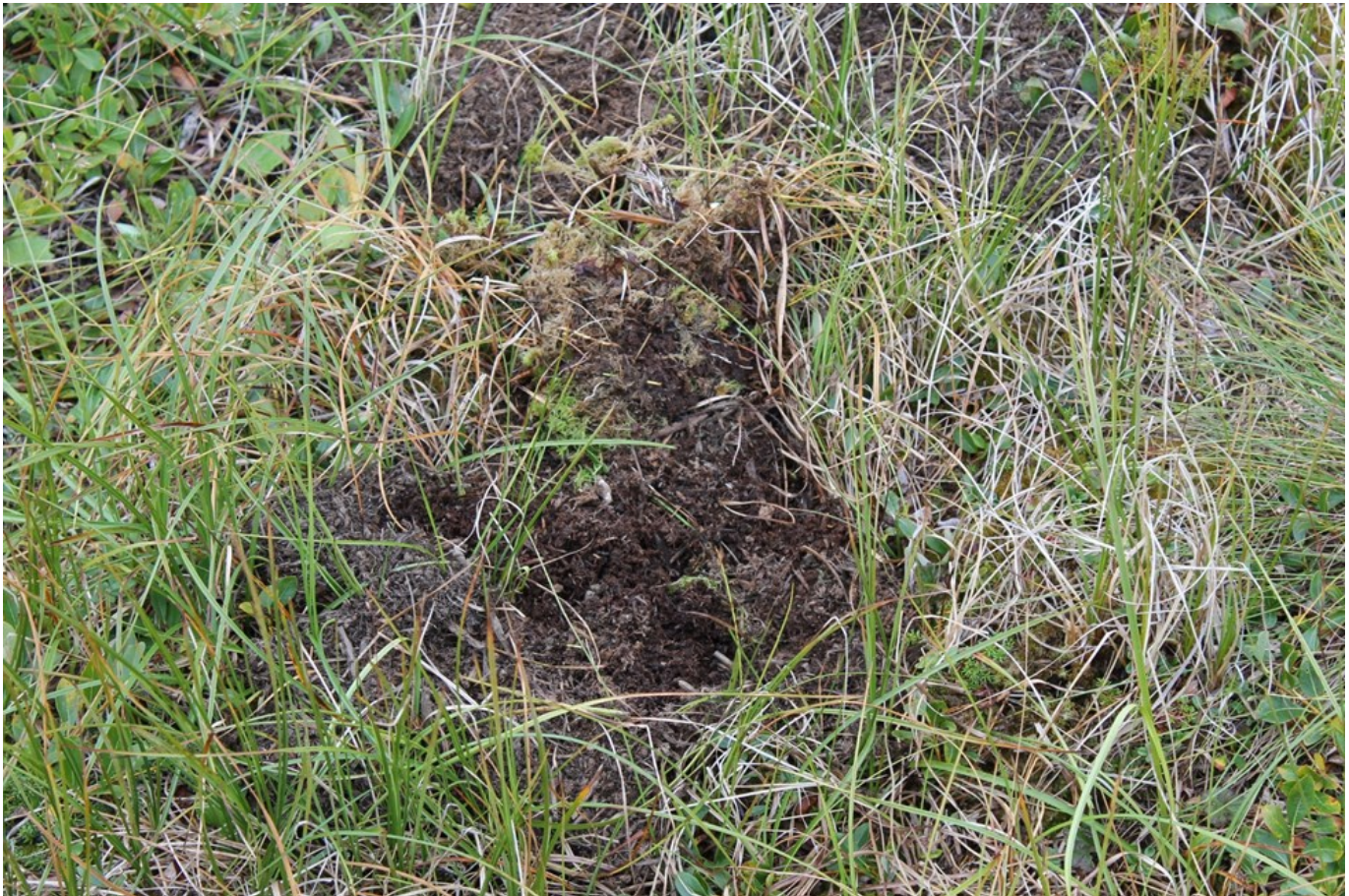
Figure 4 Summer foraging activity of the root vole.

We examined the academic literature to see whether the plant species mentioned in our interviews were also observed in biological field studies of M. oeconomus diet. While there appears to be no research in Chukotka, studies done in adjacent regions do help corroborate our ethnographic information. Most notably, biologists (Batzli and Henttonen 1990) working in arctic tundra at Toolik lake in Alaska reported finding tubers from E. angustifolium , a Hedysarum species, and Persicaria bistorta in root vole caches, giving independent support, at least for the species that study participants most commonly mentioned. Similarly, zoologists Nikiforov and Chibyev (2015) report finding Polygonum spp. and sedges in the genus Carex in root vole caches in the Central Sakha Republic.